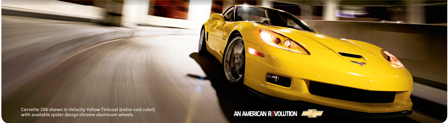
Corvette Z06 shown in Velocity Yellow Tintcoat (extra-cost color) with available spider design chrome aluminum wheels.

Corvette has followed its own formula as an American original since 1953. With capability like 190 mph on the test track for the coupe and an EPA estimated 26 MPG highway, 1 Corvette Z06 registers a test-track top speed of 198 mph and has an EPA estimated 24 MPG highway. 2 Now, Corvette's bandwidth expands even further with the return of the Corvette ZR1. 3 Powered by a supercharged 638-hp LS9 V8, it has a test-track top speed of 205 mph — a stunning, new performance benchmark for a GM production car.