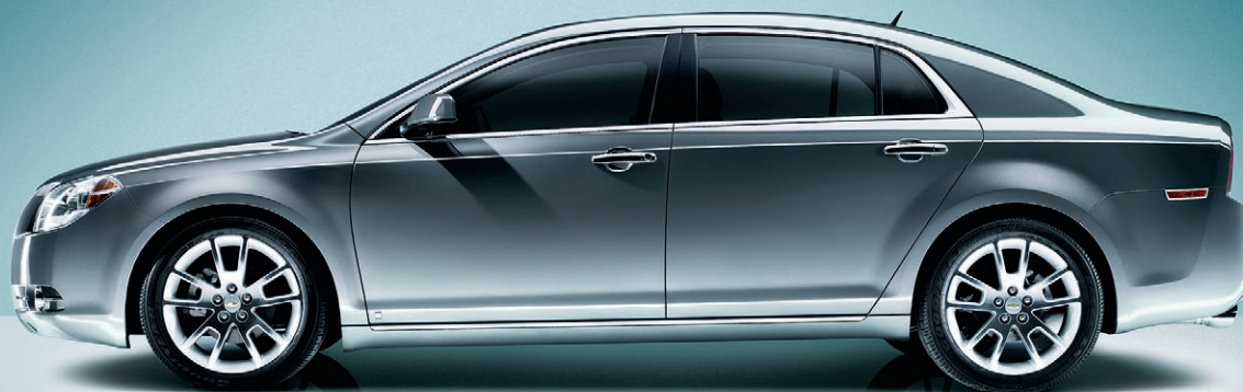
Malibu LTZ in Dark Gray Metallic with available features.

The 2008 Chevy Malibu has been recognized and honored by critics and owners alike: "Highest Ranked Midsize Car in Initial Quality" in the J.D. Power and Associates Initial Quality Study SM1 in 2008 and 2008 North American Car of the Year. And Malibu offers better highway fuel economy than any other midsize sedan; 2 an EPA estimated 33 MPG (gasoline), 34 MPG (Hybrid). It's no wonder Malibu is fast becoming the new car of choice.